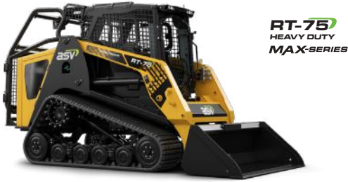
RT-75 HEAVY DUTY MAX-SERIES