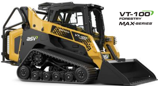
VT-100 FORESTRY MAX-SERIES