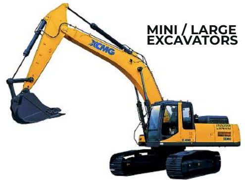
MINI / LARGE EXCAVATORS