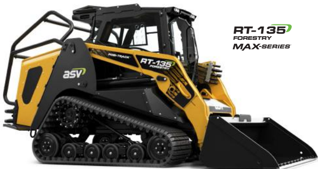
RT-135 FORESTRY MAX-SERIES